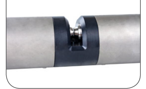
Figure 2. IQSN UV probes are rugged, accurate and designed to withstand field conditions. The optics are kept clean with UltraClean® technology and the sensor's 256-wavelength scan provides unmatched accuracy. A 1 mm gap sensor is pictured.

The Seneca team quickly set up the YSI system but there was still work ahead for optimization. The monitoring system is an important part of the strategy for efficiently achieving Seneca's stringent treatment requirements. Integrating the measurements into a stable and efficient control system would be the ultimate goal. The methanol dosing control system, as it was originally conceived, was a feed forward strategy with the probes mounted at the upstream end of the anoxic zone near the methanol dosing point. This strategy worked fine most